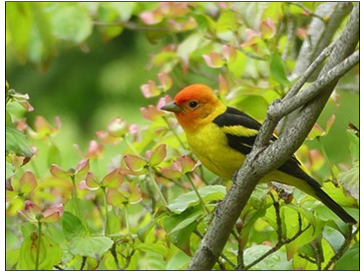
Western Tanager, male

Although I haven't seen them nesting, they have flimsy to relatively stout, loosely woven, open bowls with three to five palish blue, bluish glaucous or bluish green eggs. They hatch in