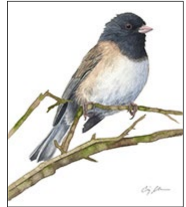
Watercolor © 2020 Craig Johnson