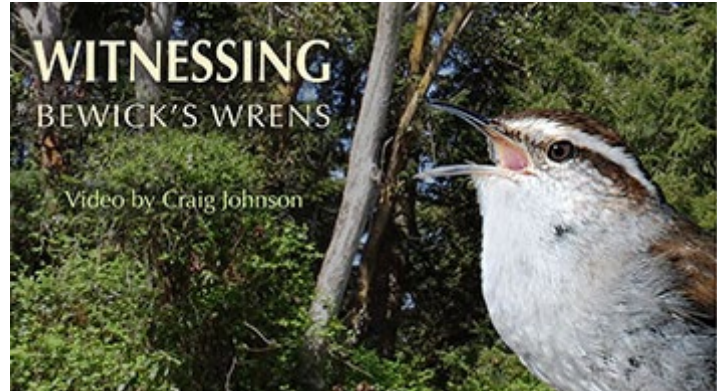
Bewick's Wren

White-headed Woodpecker on a Ponderosa Pine at the campsite.